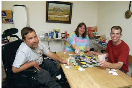
Direct Support Professionals serve Michigan's disabled citizens in a variety of capacities and in every county in the state.

The Michigan Alliance of Direct Support Professionals is a network of people committed to strengthening the quality of human services by empowering ourselves to increase our own dignity and respect. Along with the National Alliance, we strive to promote the development of a competent human services workforce that supports individuals in achieving their life goals.