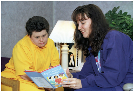
Direct Support Professionals participate in the lives of those they serve in a variety of ways.

Since 1999, the Michigan Alliance of Direct Support Professionals (MADSP) has worked tirelessly to uplift and support the field of Direct Support in Michigan and those who dedicate their lives to it. Through a combination of advocacy, legislative action, and community support, the Alliance has strived to bring attention to the issues and concerns confronting Direct Support Professionals and those that they serve. MADSP members come from every walk of life and hail from all corners of the state of Michigan. They function in a variety of ways in the field of Direct Support: members include foster parents, consumer advocates, group home employees, family members, consumers and many more. In the end, all MADSP members share a common goal, which is to improve the field of Direct Support and in turn better the lives of those they serve and themselves.